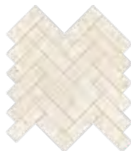
RISE Dawn Herringbone Mosaic 11 3/4 "x11 3/4 " - 30x30 cm (Mosaic 1"x4") 600110000630