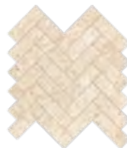
RISE Light Herringbone Mosaic 11 3/4 "x11 3/4 " - 30x30 cm (Mosaic 1"x4") 600110000631