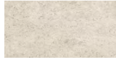
RISE Cloud 11 3/4 "x23 5/8 " - 30x60 cm 610010002252