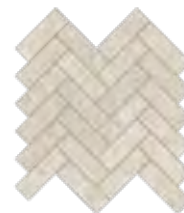
RISE Cloud Herringbone Mosaic 11 3/4 "x11 3/4 " - 30x30 cm (Mosaic 1"x4") 600110000632