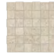
RISE Dusk Net Mosaic 11 3/4 "x11 3/4 " - 30x30 cm (Mosaic 1.5"x2") 600110000629