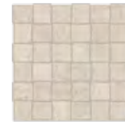
RISE Cloud Net Mosaic 11 3/4 "x11 3/4 " - 30x30 cm (Mosaic 1.5"x2") 600110000628