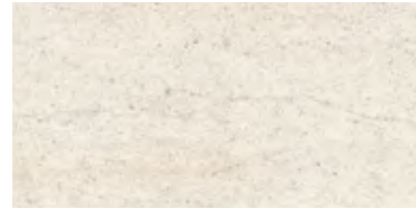
RISE Dawn 11 3/4 "x23 5/8 " - 30x60 cm 610010002250