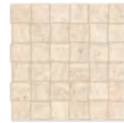
RISE Light Net Mosaic 11 3/4 "x11 3/4 " - 30x30 cm (Mosaic 1.5"x2") 600110000627