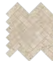
RISE Dusk Herringbone Mosaic 11 3/4 "x11 3/4 " - 30x30 cm (Mosaic 1"x4") 600110000633