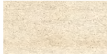
RISE Light 11 3/4 "x23 5/8 " - 30x60 cm 610010002251