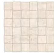
RISE Dawn Net Mosaic 11 3/4 "x11 3/4 " - 30x30 cm (Mosaic 1.5"x2") 600110000626